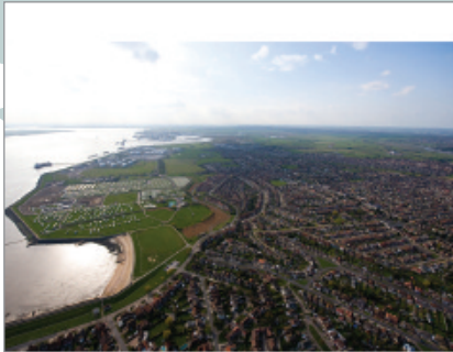
Small text caption at the bottom of the left page of the double-page spread.