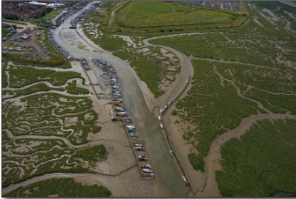
The marshes at Lee Beck are an important site for wildfowl and provide popular moorings for sailors.