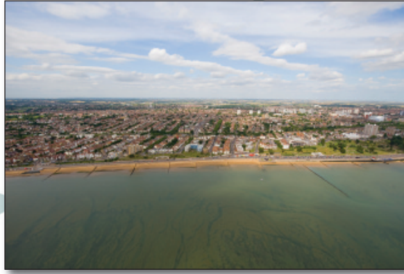
Westcliff-on-Sea, looking northwards into the heart of Essex.