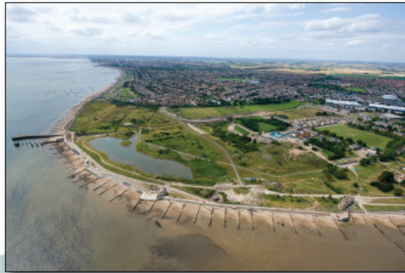
Shoeburyness looking west along the Thames Estuary towards Southend-on-Sea.