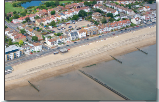
Early morning Southend, and the beaches have yet to come to life.