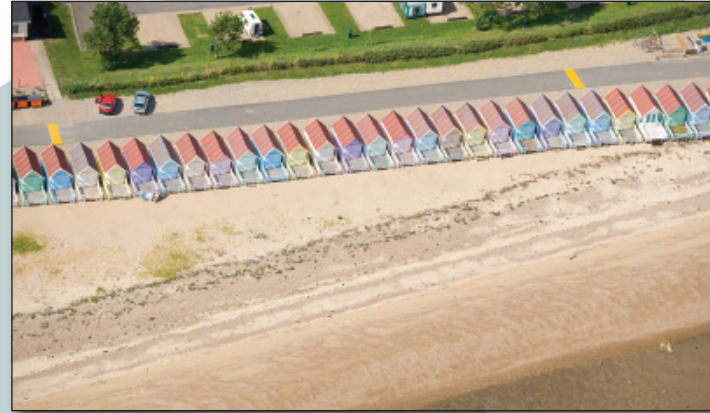
Beach huts, West Mersea.